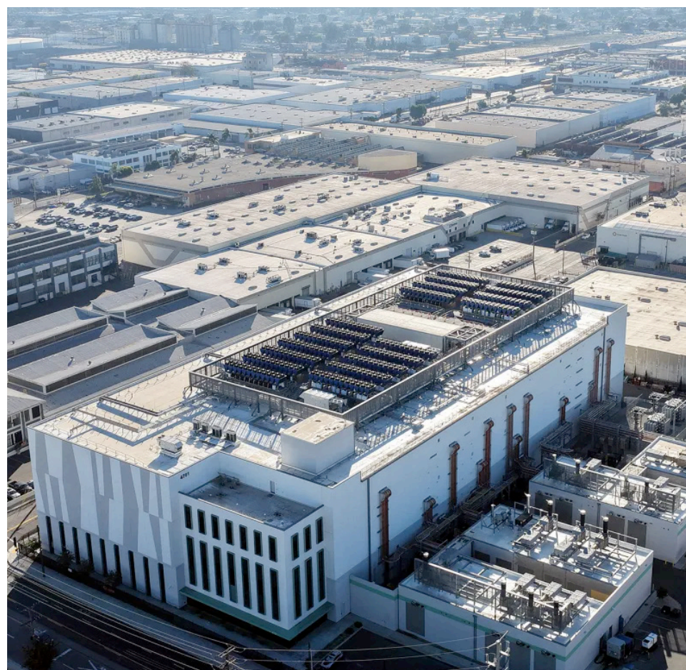
An aerial view of a 33 megawatt data center with closed-loop cooling system in Vernon on Oct. 20, 2025. A surge in demand for AI infrastructure is fueling a boom in data centers across the country and worldwide.